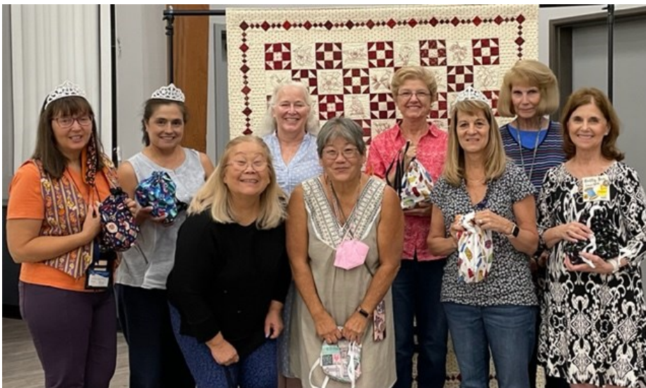
Thank you 2021-2022 Board