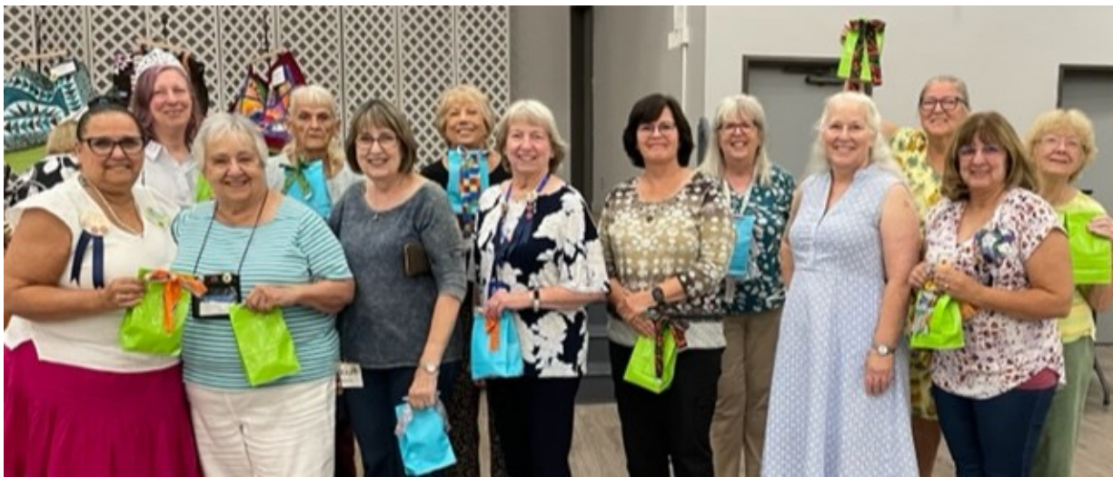
Thank you 2021-2022 Committee Leaders