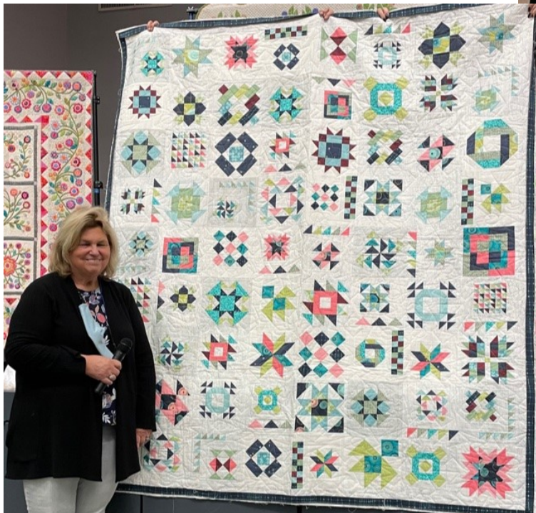
Modern Summer Moon. Three of each block, three different sizes of each block!!