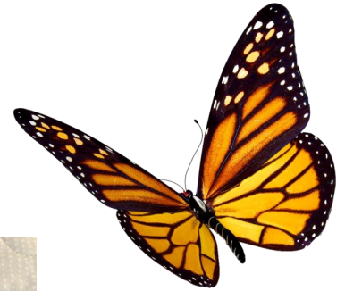
Butterflies by Trudy