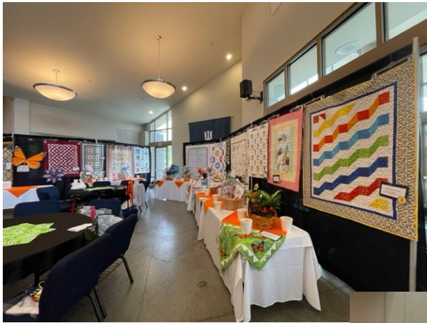
Guild Member Quilts