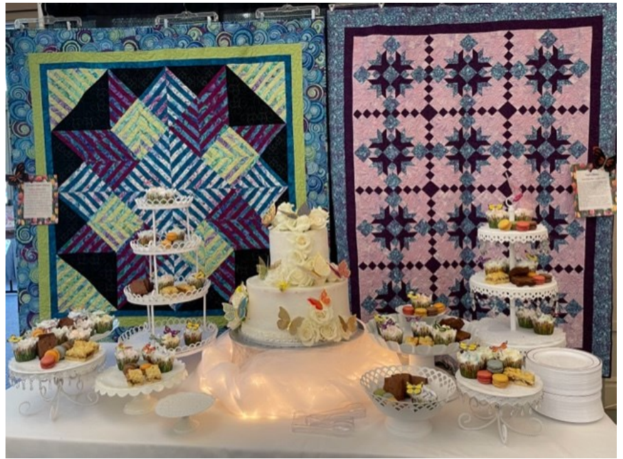
Dessert Tables Cake by Pattie