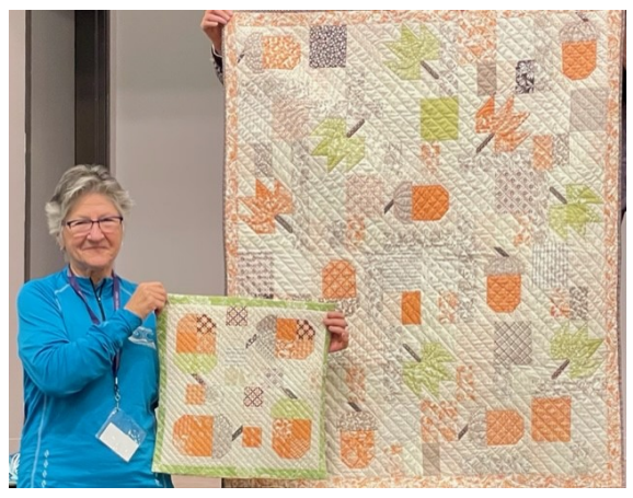
Fig Tree throw and pillow